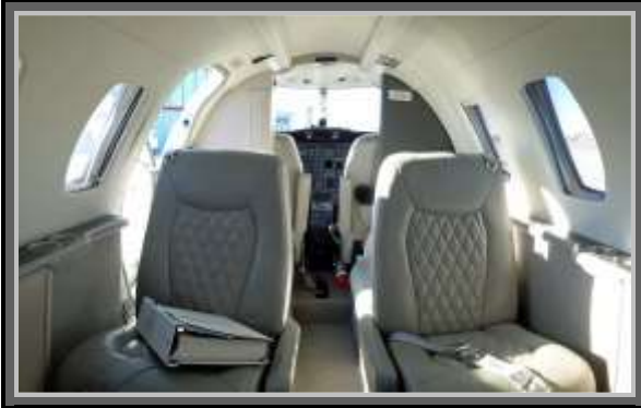
Forward View of Cabin