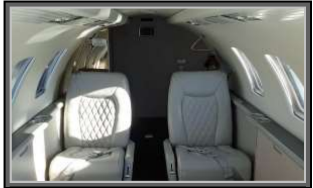
Aft View of Cabin